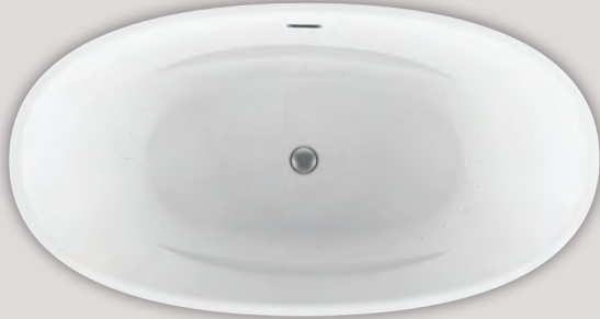
LIBRA OVAL 6635 (FREESTANDING)