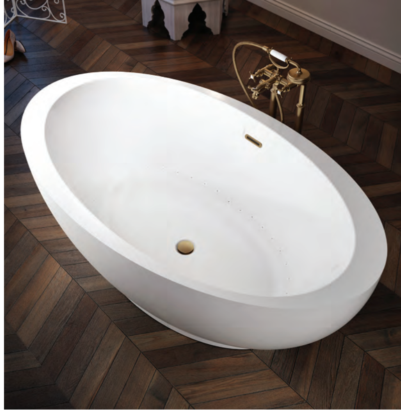
OPALIA 6839 OBLIQUE ELLIPSE - RIGHT (FREESTANDING)