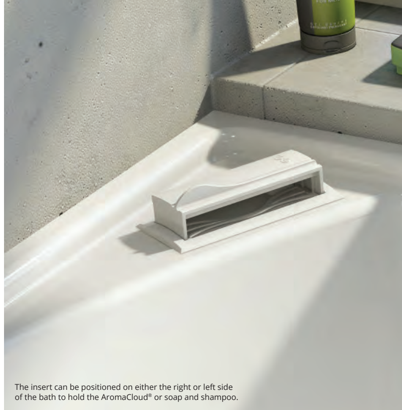
The insert can be positioned on either the right or left side of the bath to hold the AromaCloud® or soap and shampoo.