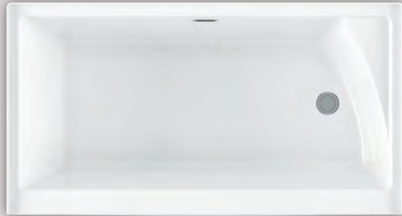
CITTI 6032 WITH INSERT