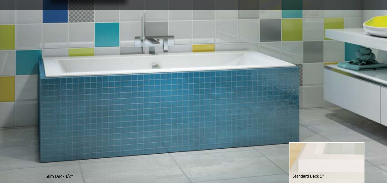
Slim Deck 1/2"