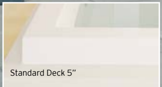
Standard Deck 5"