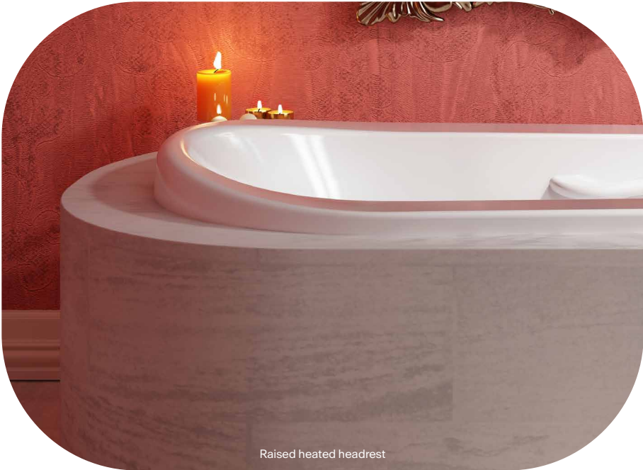
Raised heated headrest