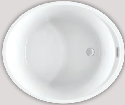
BEONE 4639 (FREESTANDING)