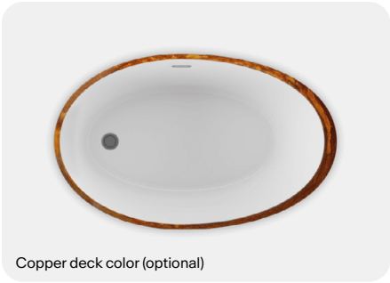
Copper deck color (optional)