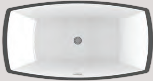
CHARISM 6434 (FREESTANDING)