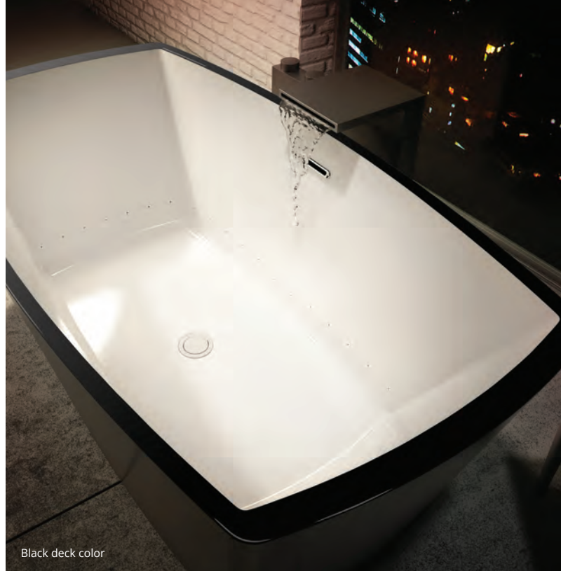
Black deck color