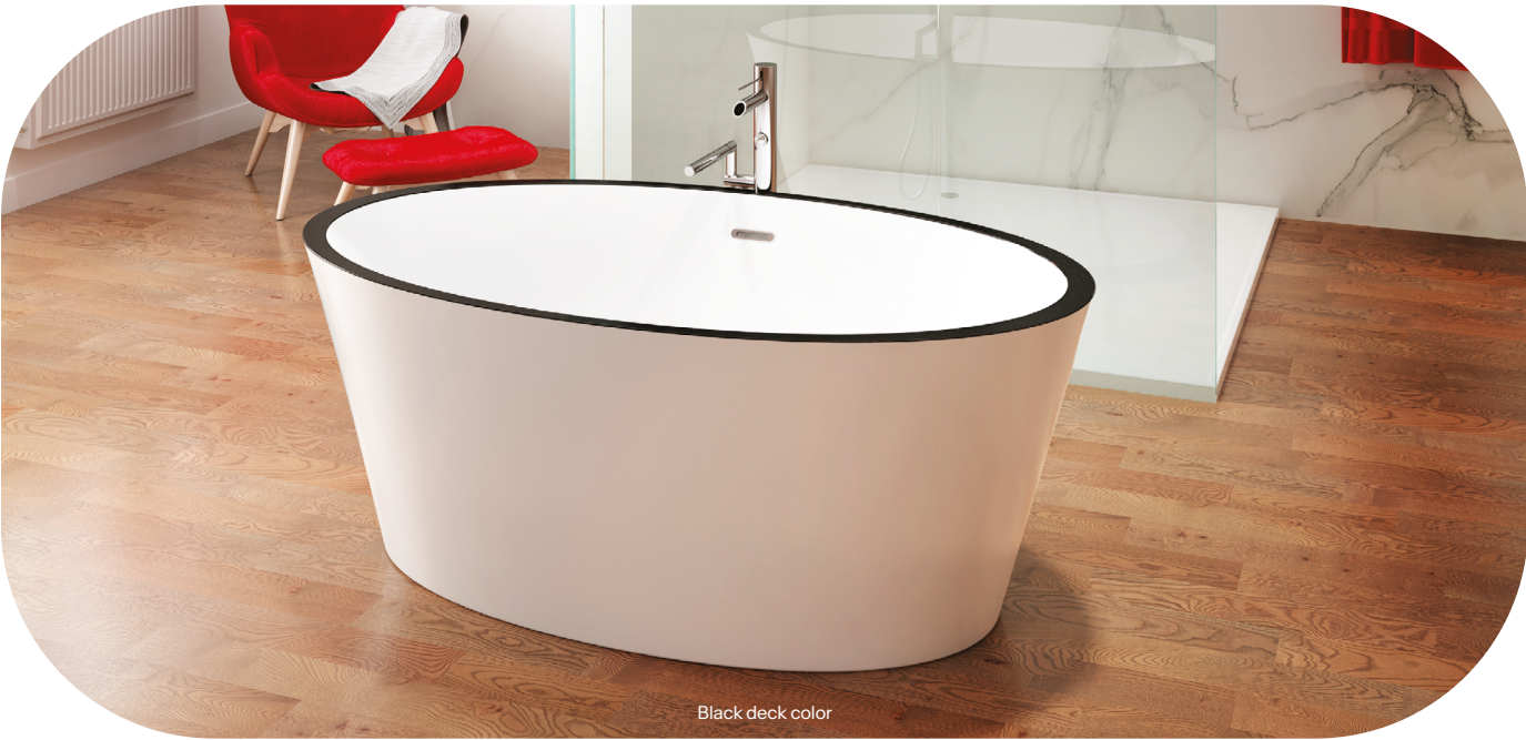
Black deck color