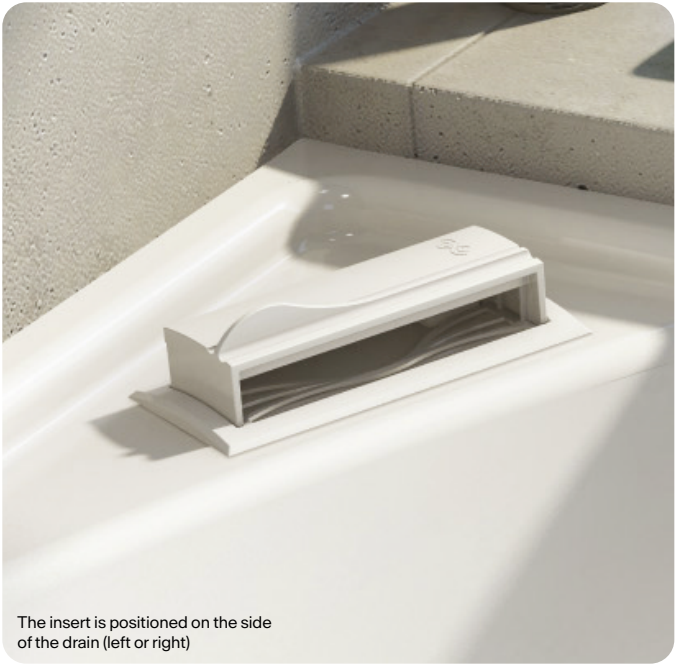
The insert is positioned on the side of the drain (left or right)