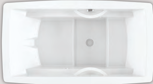
ESSENCIA 6838 (FREESTANDING)