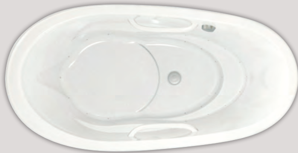
ESSENCIA OVAL 7236