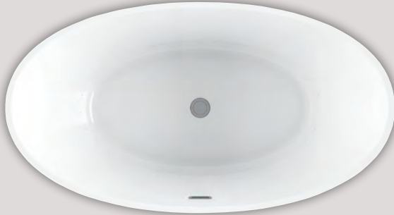
EVANESCENCE OVAL 7440 (FREESTANDING)