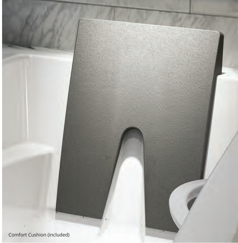
Comfort Cushion (included)