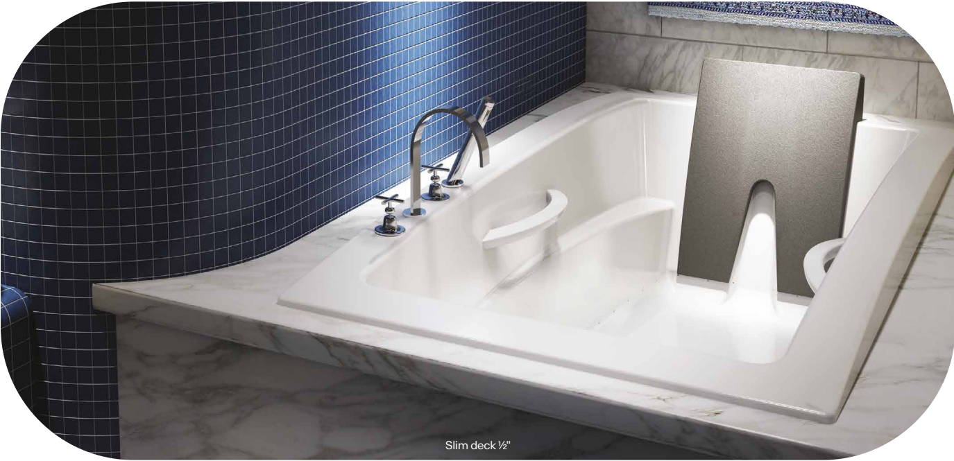
Slim deck ½"