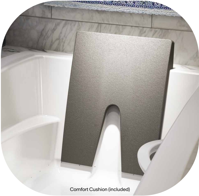
Comfort Cushion (included)