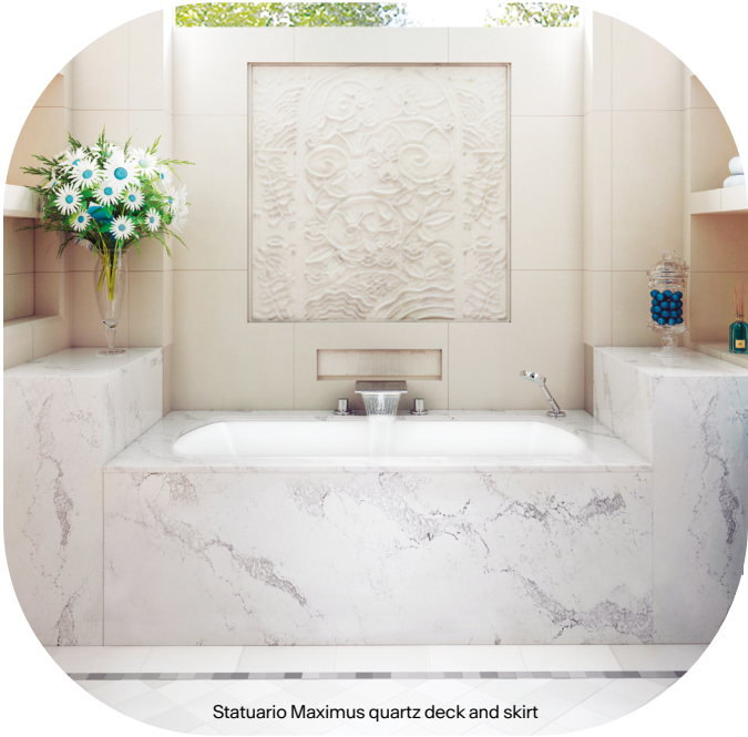
Statuario Maximus quartz deck and skirt