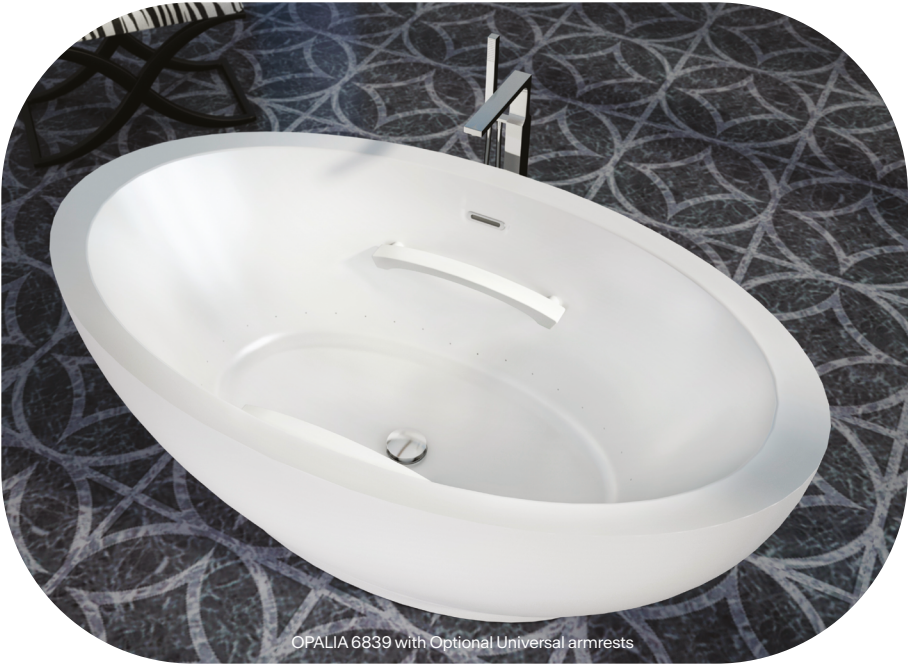
OPALIA 6839 with Optional Universal armrests