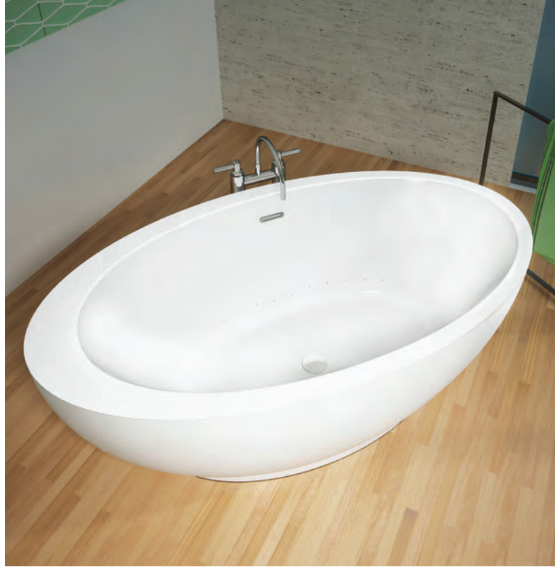
OPALIA 6839 OFF-CENTERED ELLIPSE - RIGHT (FREESTANDING)