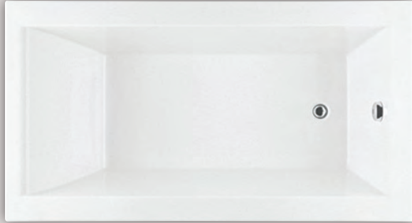
ORIGAMI 6032 ORIGINAL SERIES