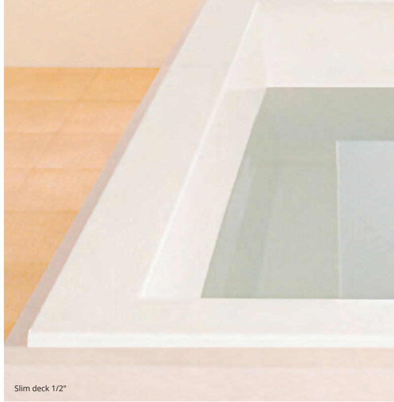
Slim deck 1/2"