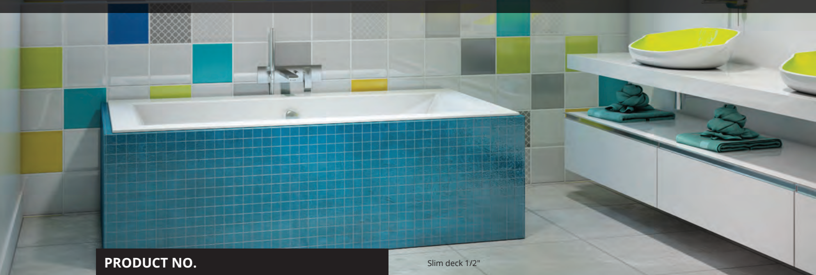
Slim deck 1/2"

The traditional Japanese art of folding paper into symbolic shapes is the inspiration behind the Origami Collection, which stands out for its clean lines and versatility.