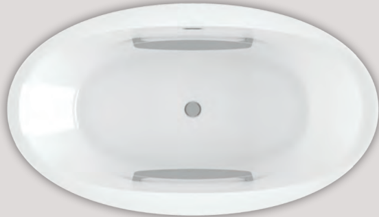
Armrest (2), offered in option