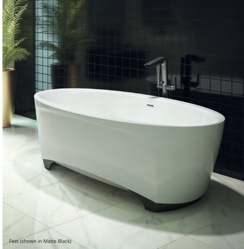
Feet (shown in Matte Black)