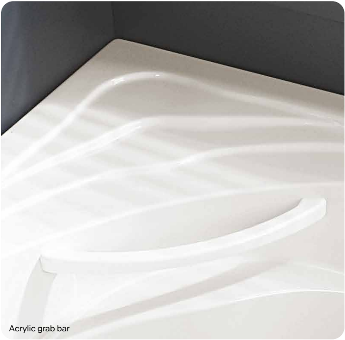
Acrylic grab bar