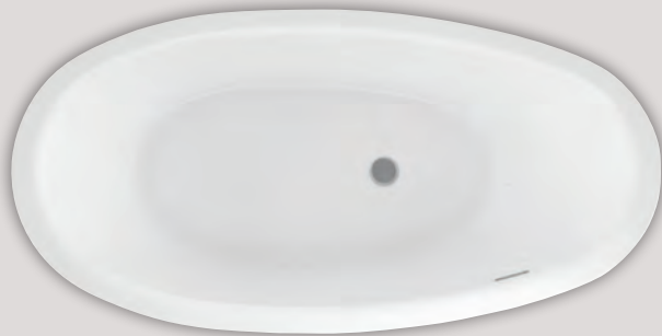
ESSENCIA DESIGN 7438