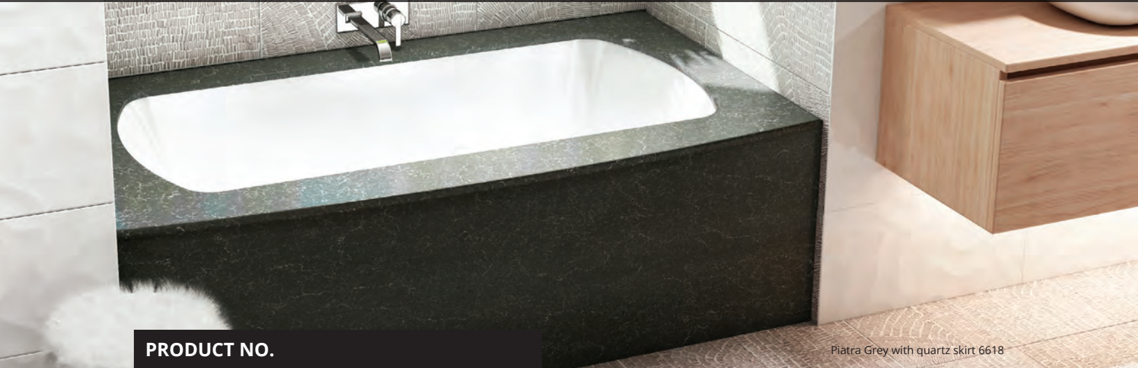
Piatra Grey with quartz skirt 6618

Monarch is a refined collection of therapeutic baths with distinctive Quartz deck surfaces, for a look that's noble and pure.