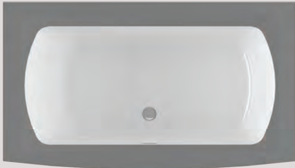
MONARCH 6638F CURVED DECK – FRONT