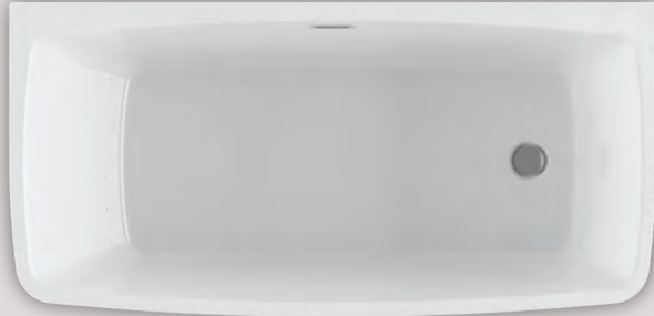
VIBE BACK TO WALL 5828 (FREESTANDING)